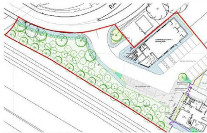
Extract from 'Proposed Site Plan - Sheet 1'

Please see the following drawing extract for ease of reference: